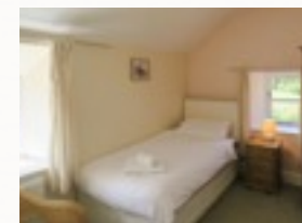
Single en-suite accommodation

Enjoy a full breakfast from 7.30am. Class starts at 9.00am. Morning tea and biscuits will be served at 10.30am followed by a light lunch at midday. Afternoon class starts at 1.00pm closing at 3pm with afternoon tea and cake. You are welcome to remain in the art studio to work on your project prior to dinner which will be served at 7.00pm. Private lessons will be available during this time, but booking is essential. There will be an evening activity at 8.30pm.