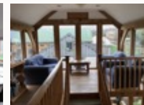
Guest lounge area