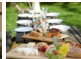
Freshly prepared meals